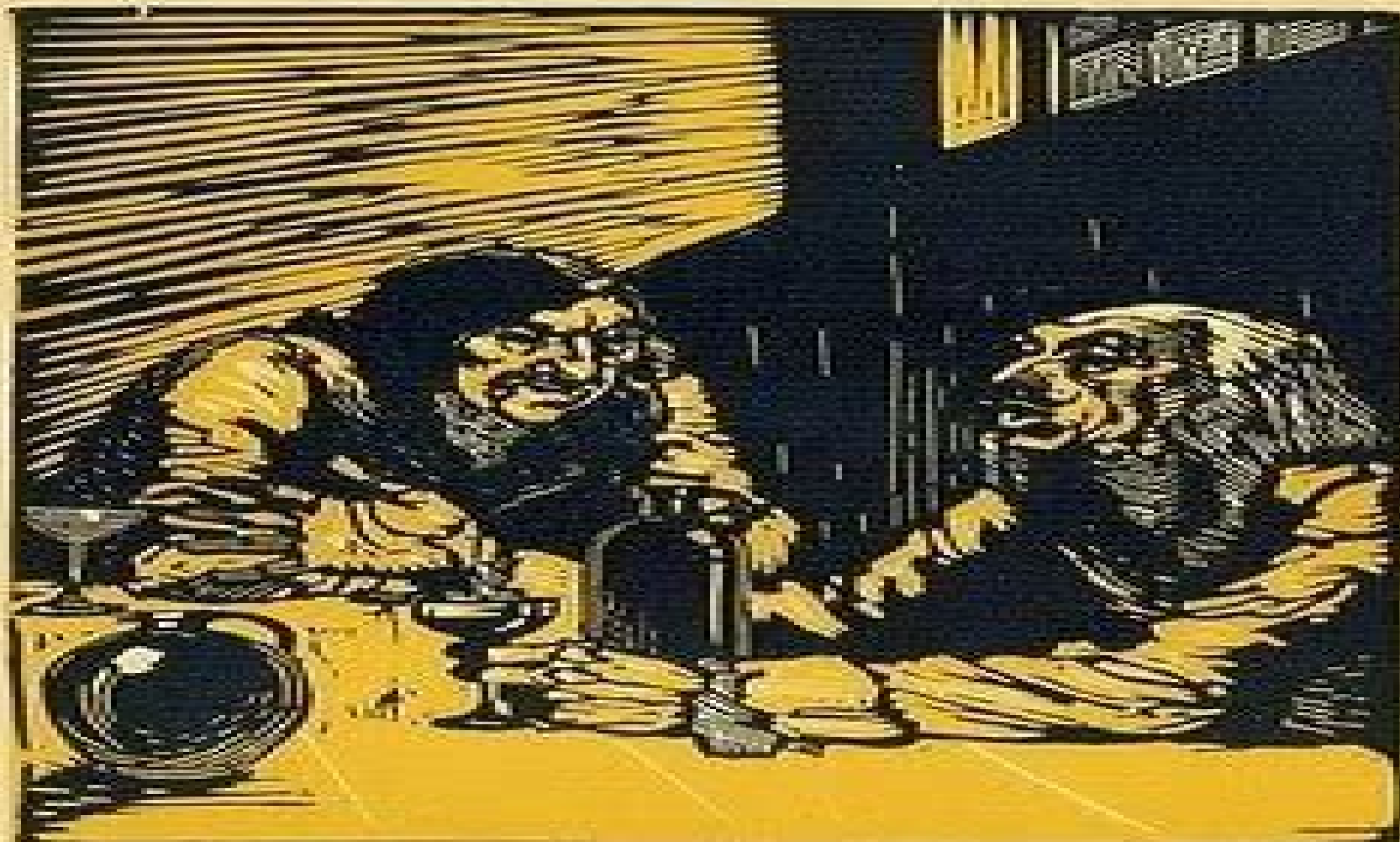
That evening the Marshalls were a very happy man.