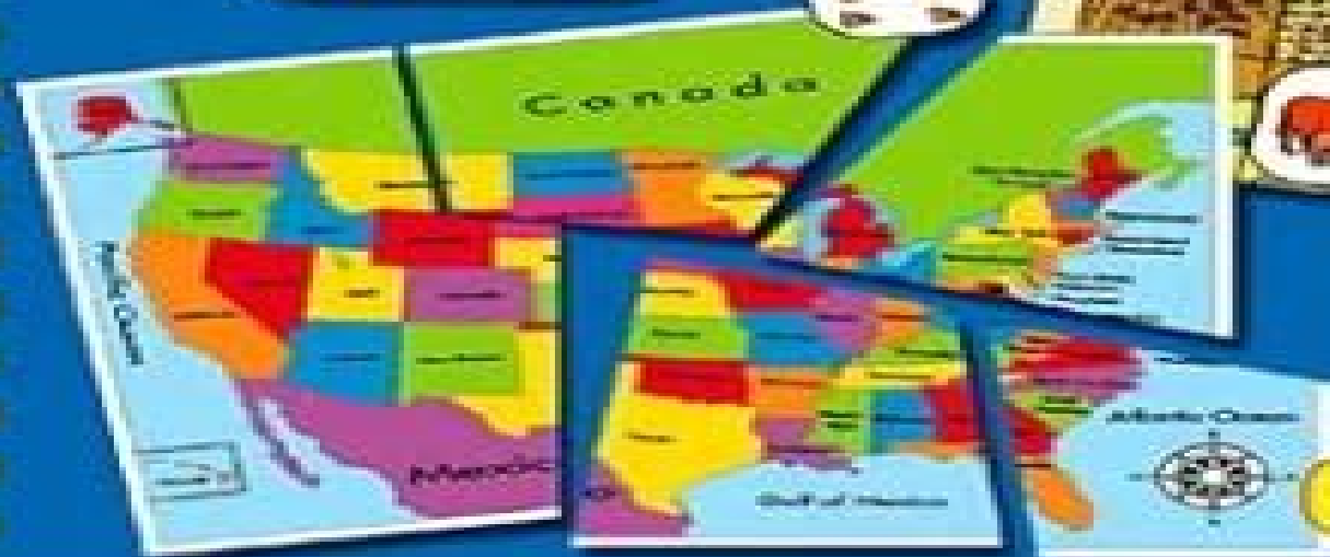
United States Map Puzzle