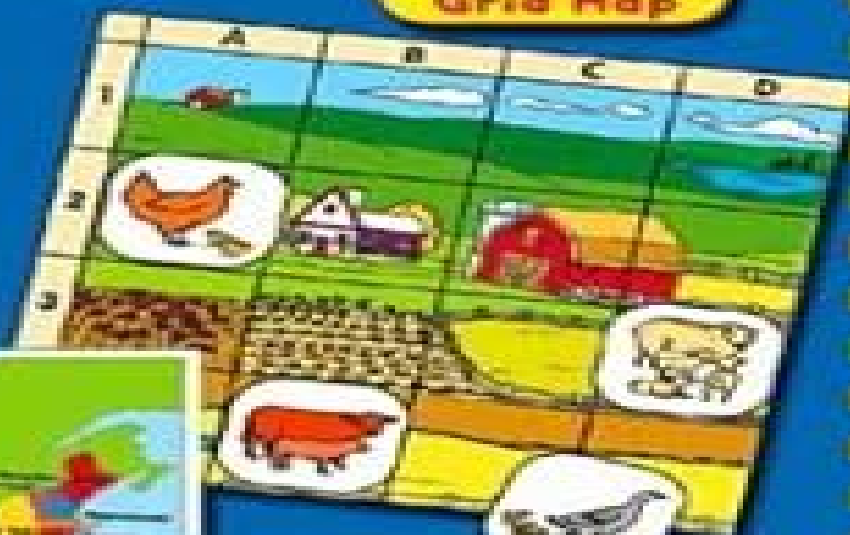
Barnyard Grid Map