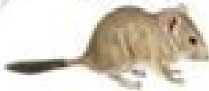
crest-tailed marsupial mouse