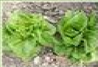
Chapters: Introduction Getting started Types of models