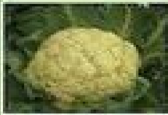
Abstract Keywords: adolescents, delinquency, family, intervention, parents, self-esteem, social skills, treatment, violence