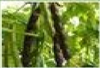
Chengdu: Land of Tigers