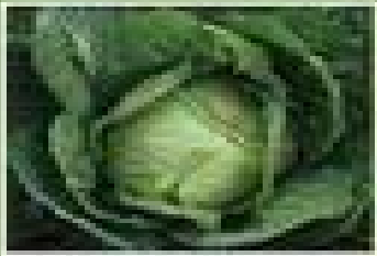
Downloaded from http://www.sagepub.com at http://www.sagepub.com