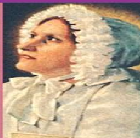
Bl. Anna Maria Taigi (1769-1837), wife, mother of seven, mystic and counselor of Popes and Saints.