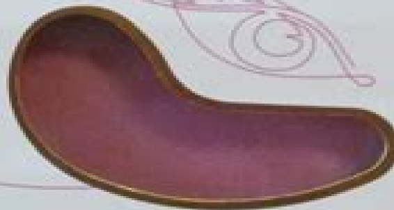
Pink Hydrogel Eye Mask

Specially prepared eye gel to soothe and cool