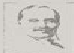
H. G. WELLS

IN AMERICA—Selected by The Book-of-the-Month Club