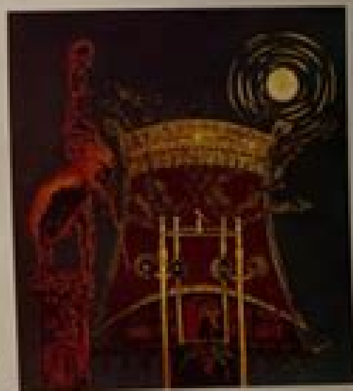
HỒI ỨNG Sơn dầu - 1988 100x150 cm