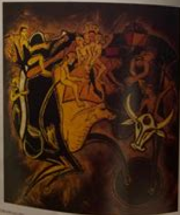
1. HỒI ỨNG Sơn dầu - 1988 100x150 cm