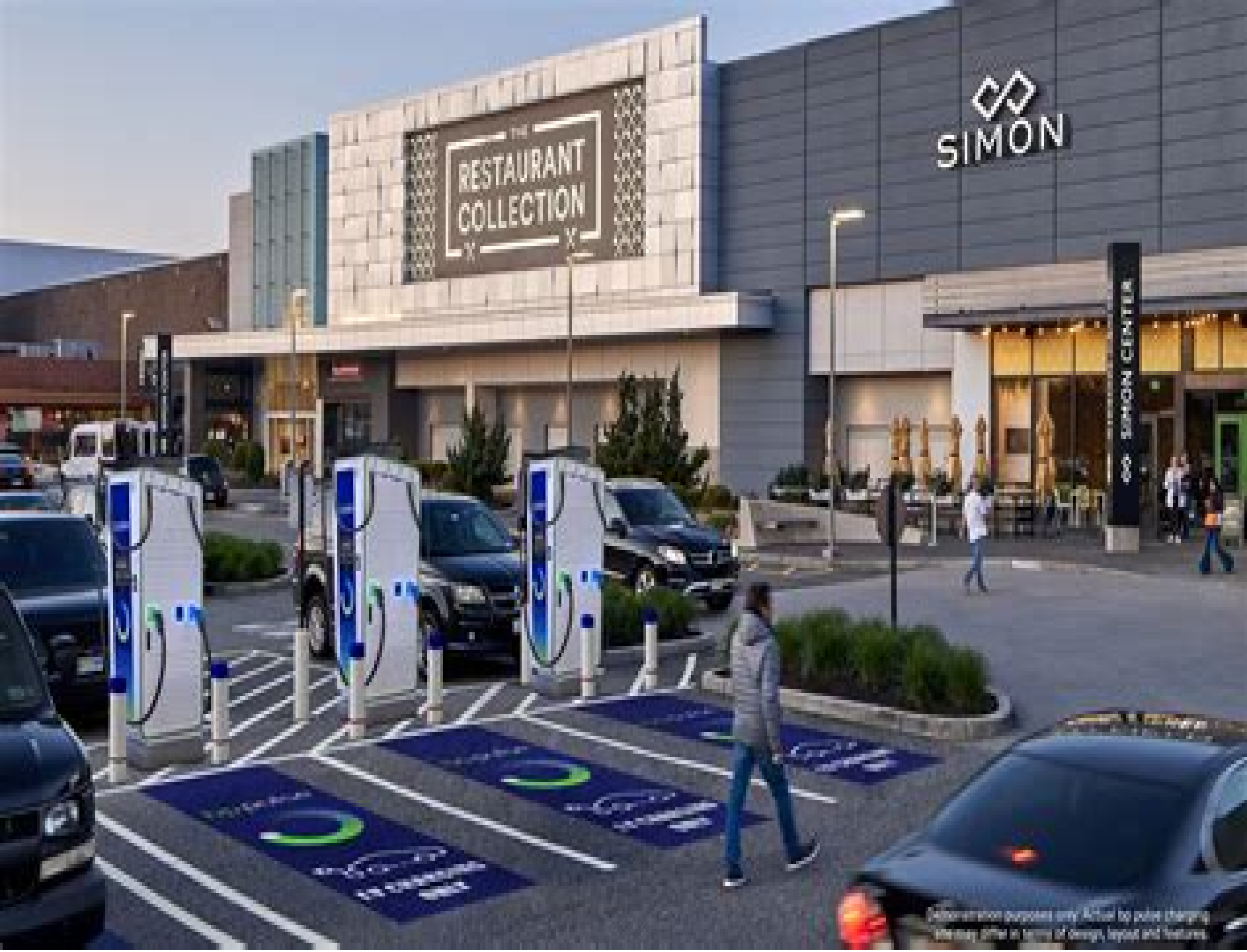
Illustration purposes only. Actual top pulse charging station may differ in terms of design, layout and features.