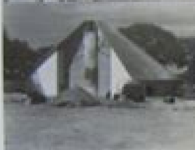
Left: The Solomons Scout Association's chapel. A great annual day in CO's program is the World Council of Churches for assistance with building the chapel was largely ignored. (The chapel had actually been built in 1970, but was not used until the 1980s.)