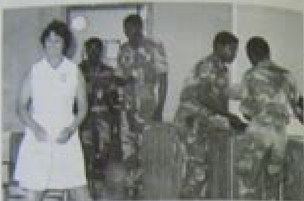
Left: A group of people, including a woman in a white dress and several men in military uniforms, standing in front of a building.