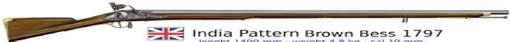
India Pattern Brown Bess 1797

length 1490 mm - weight 4.8 kg - cal 19 mm