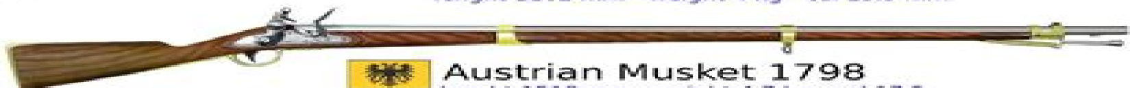
Austrian Musket 1798

length 1162 mm - weight 4 kg - cal 15.9 mm