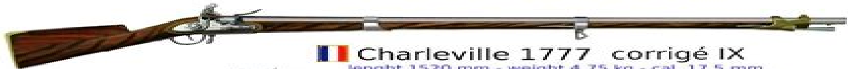
Charleville 1777 corrigé IX

length 1458 mm - weight 5 kg - cal 17.8 mm