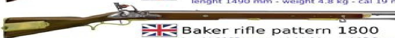
Baker rifle pattern 1800

length 1490 mm - weight 4.8 kg - cal 19 mm