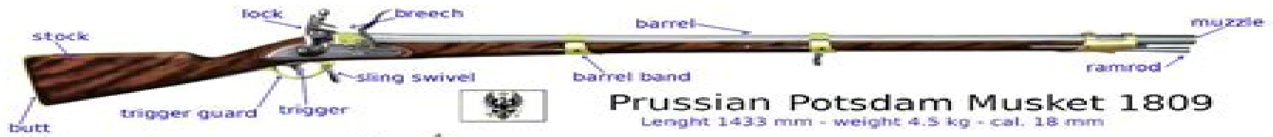
Prussian Potsdam Musket 1809

Length 1433 mm - weight 4.5 kg - cal. 18 mm