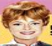
LOST IN SPACE