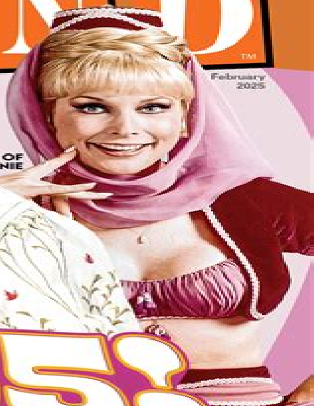
I DREAM OF JEANIE