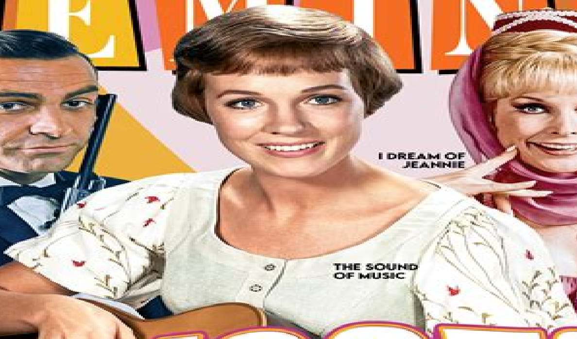
THE SOUND OF MUSIC