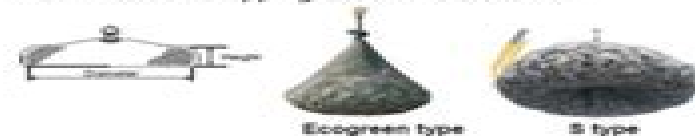
Figure 1 -Kyowa Rock Bags

Stage 2 of testing examined distinctive aspects of the Stockton Beach design following the commencement of its construction. Design wave and water level conditions specific to Stockton Beach were used to examine how two different structure slope and crest elevation options affected the hydraulic stability of the Rock Bags and the mean wave overtopping rate over the seawall.