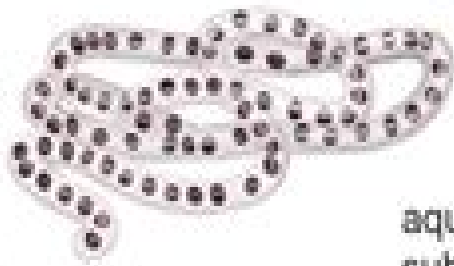
aquatic eggs attached to submerged vegetation