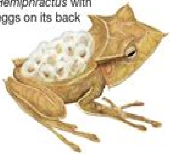
Hemiphractus with eggs on its back