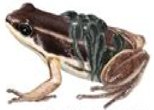
tadpoles on the back of a male Colostethus