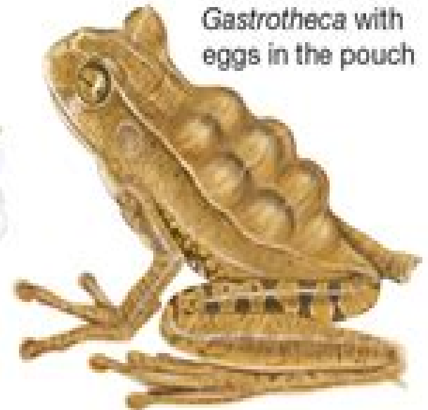
Gastrotheca with eggs in the pouch