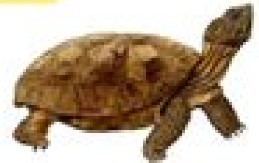
Tortoises and Turtles