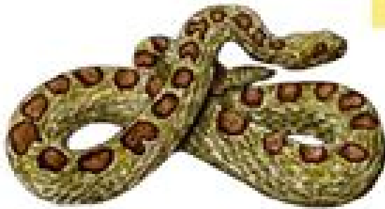
Snakes and Lizards

tough, dry skin protective scales or plates