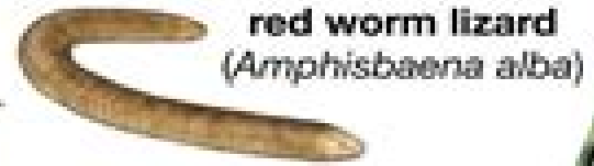
red worm lizard ( Amphisbaena alba )