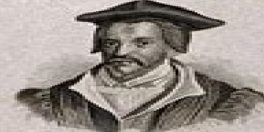
Cardinal de Noailles.