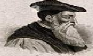
Cardinal de Lorraine.