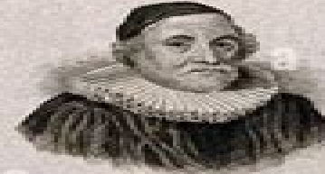
Cardinal de Rohan.