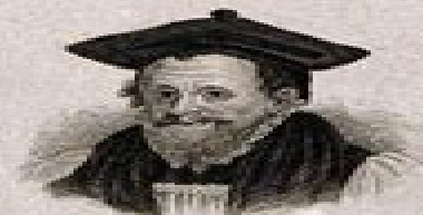
Cardinal de Richelieu.