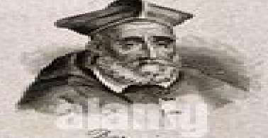
Cardinal de Noailles.