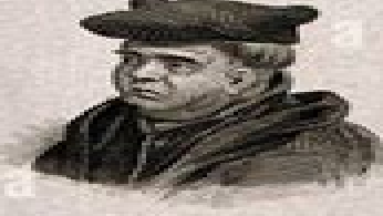
Cardinal de Rohan.