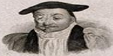
Cardinal de Lorraine.