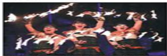
Performers do fire dance to celebrate the start of Hogmanay, the Scottish New Year, on Sunday in Edinburgh, Scotland.

Scotland is a beautiful country with a rich history and culture. It is a great destination for Chinese tourists. The Scottish government is working hard to attract more Chinese visitors.