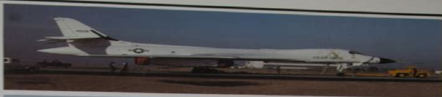
Illustration © 1988, Rockwell International