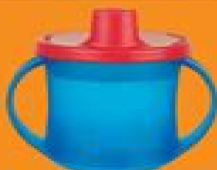
tacita con tapa sippy cup