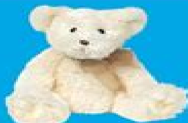
osito de peluche teddy bear