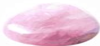
ROSE QUARTZ General love