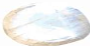
MOONSTONE To get engaged