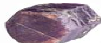
RUBY Love & confidence