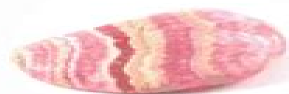
MAGNETITE Successful casual dating