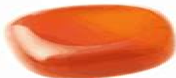
CARNELIAN Sexual intimacy