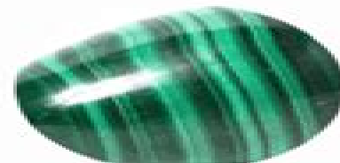
JADE Manifest beauty