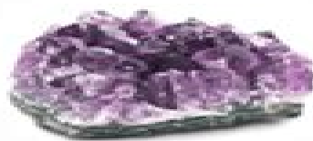
AMETHYST Heal from a breakup