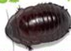
Giant Burrowing Cockroach