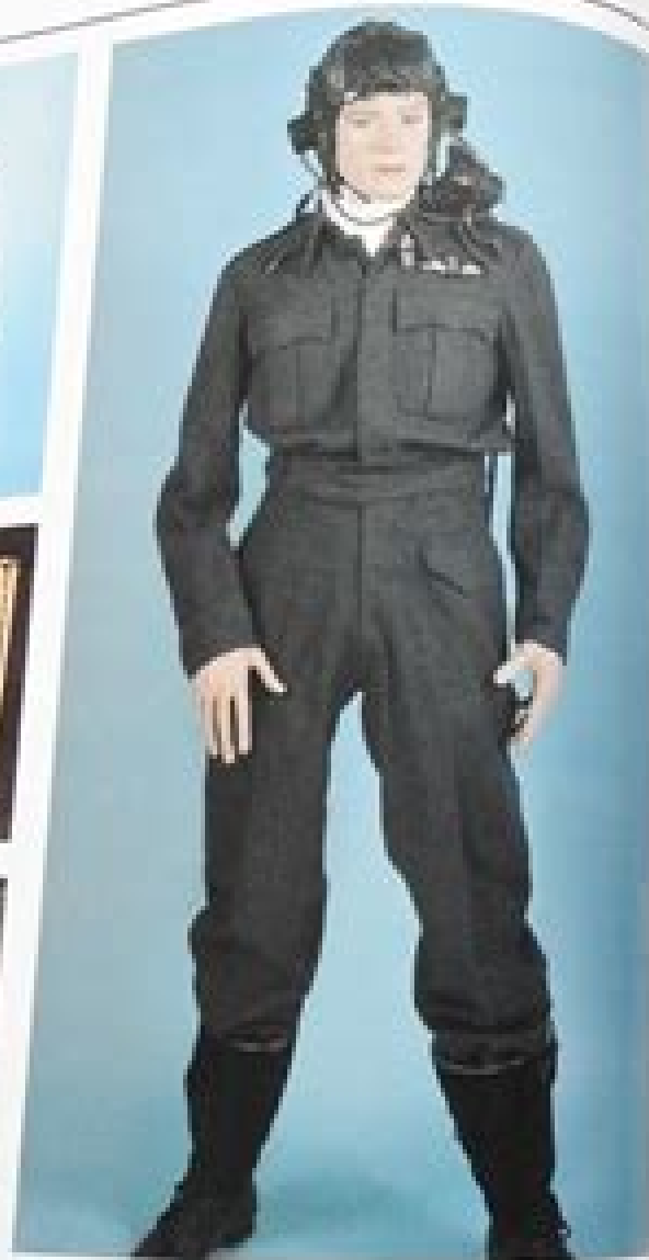
Left: The flight helmet (shown and shown)

The suit was later changed to a flight suit, and the suit was usually made of a material that was not as good as the material that it was made of in 1945. The suit was made of a material that was not as good as the material that it was made of in 1945. The suit was made of a material that was not as good as the material that it was made of in 1945.