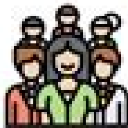
3.0: HUMAN-CENTERED MARKETING