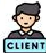
2.0: CUSTOMER- CENTRIC MARKETING