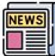
4.0: FROM TRADITIONAL TO DIGITAL MARKETING