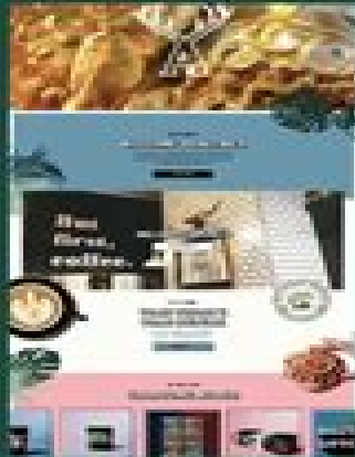
FOOD & DRINK Alfred