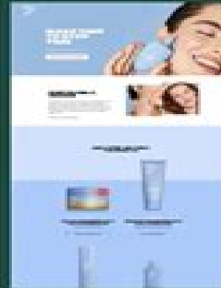
BEAUTY & COSMETICS Them I Met You