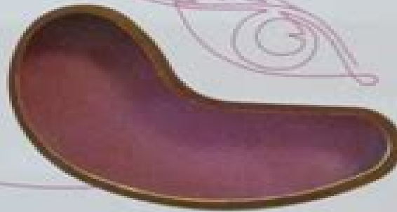
Pink Hydrogel Eye Mask

Specially prepared eye gel to soothe and cool