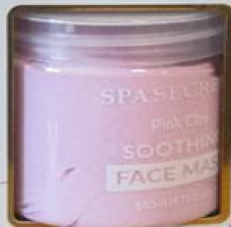
Pink Clay Mask

Specially prepared eye gel to soothe and cool