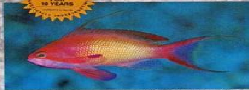
Acanthurus nigrofasciatus .

From choosing and using the equipment right through picking the best tankmates and detecting and treating diseases—all by the world's foremost authority on miniature reef aquariums.