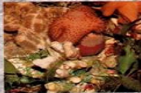
Miniature reef scene.