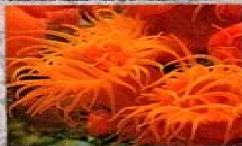
Actinia equina .