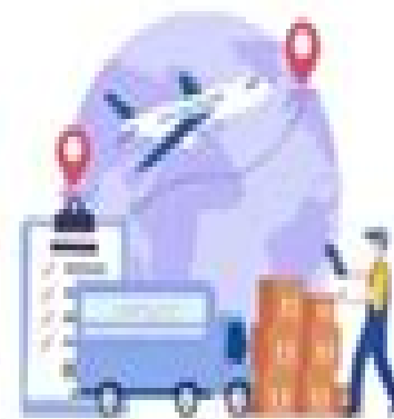
Marketing and Distribution