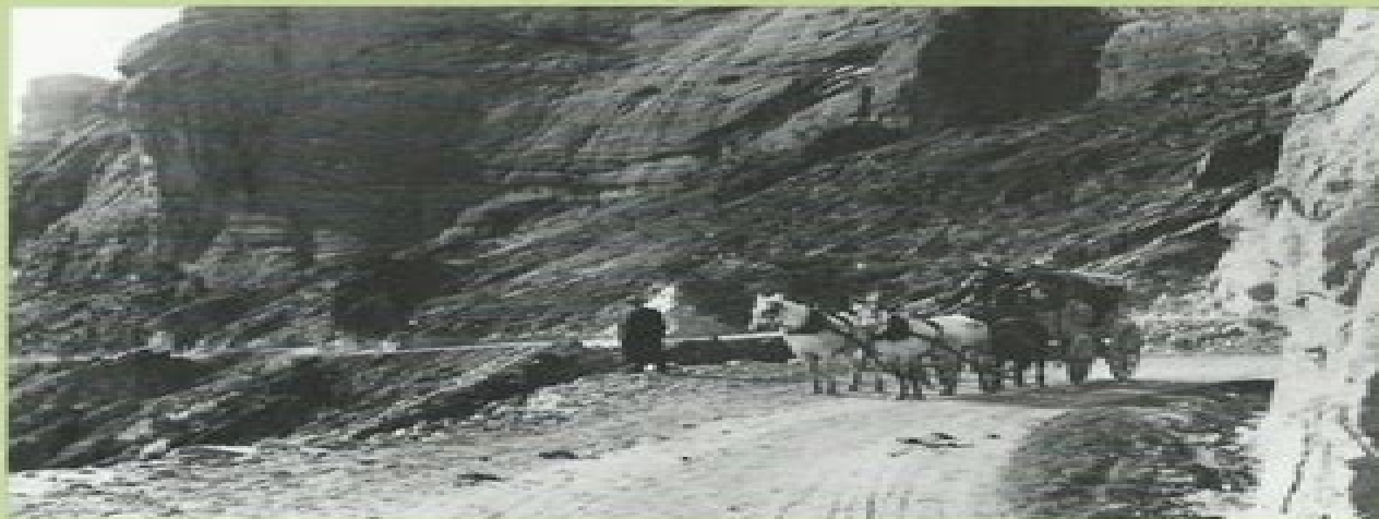
Fish Creek Hill on the Apache Trail