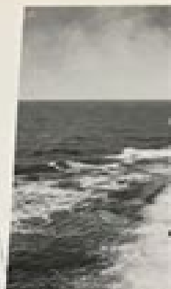
Cutting through water leaving No.