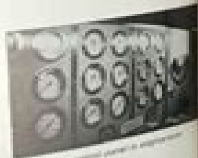
Engine room control panel in engine room

Each of the four blades are so delicately balanced, a man can turn with his hands.