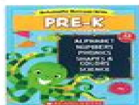
Scholastic Success With Pre-K 978-1-338-75857-3

Look for these other Scholastic Success With titles: