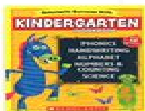
Scholastic Success With Kindergarten 978-1-338-75858-0