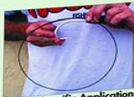
Species Specific Applications

Learn How to Rig Balleyhoo, Mullet & Mackerel to Catch Big Game Fish