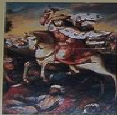
St. George and the Dragon, 1989, J. Carter Brown

- J. Carter Brown, RINGS exhibition director and Director Emeritus, National Gallery of Art, Washington, D.C.