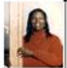
Contemporary and Post-Modern Period