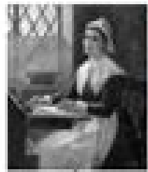
The Puritan Era