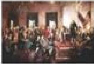
Age of Reason