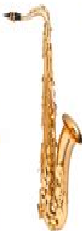
TENOR B \flat