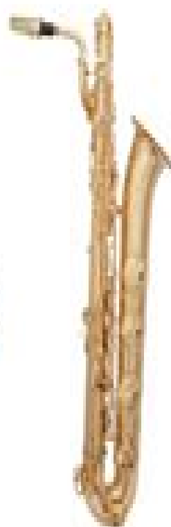
BARÍTONO E \flat