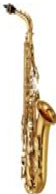
ALTO E \flat