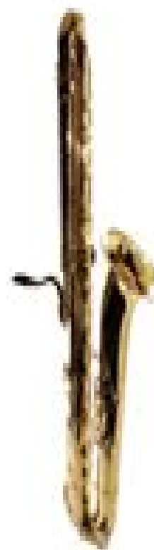
CONTRABAIXO E \flat