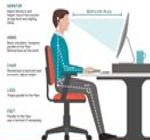
CORRECT SITTING POSITION