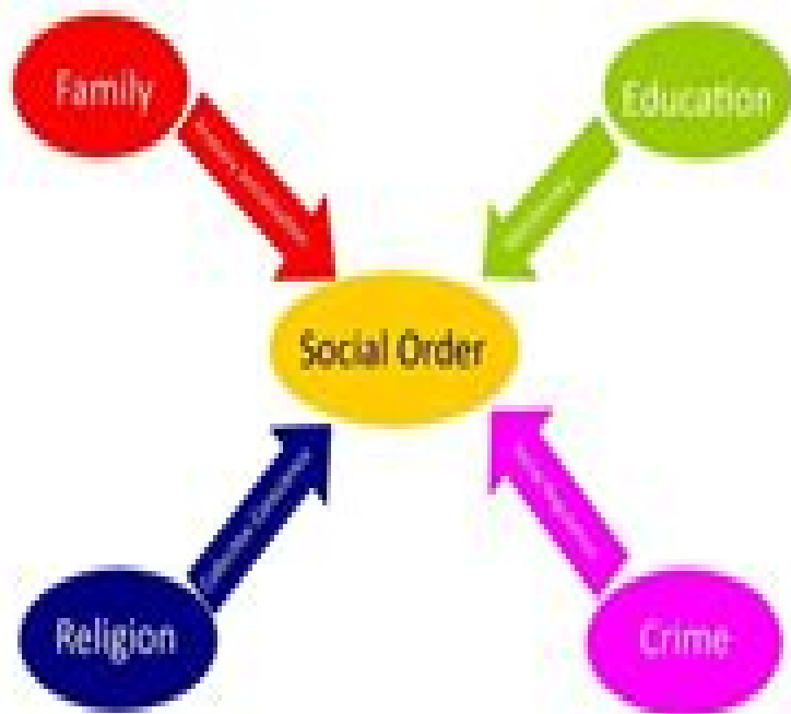
A Structural-Functionalist Understanding of Deviance.