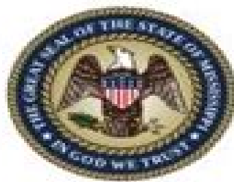
Mississippi state seal