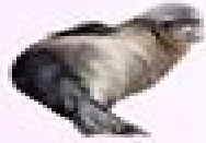
Hawaiian Monk Seal