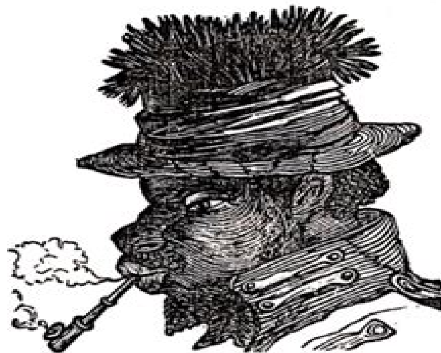
Hottentot Wagoner — Caffre War.