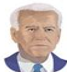
JOE BIDEN WINNER