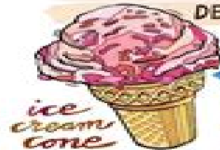
ice cream cone