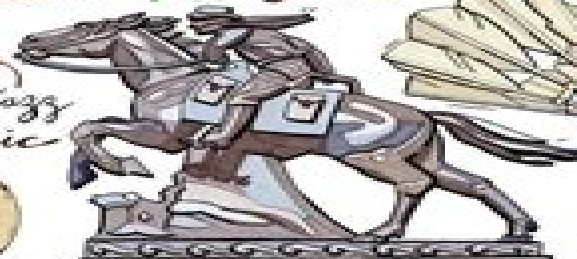
The Pony Express