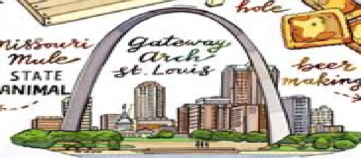
Gateway Arch St. Louis