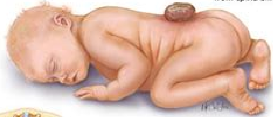
Cyst on baby's back from spina bifida