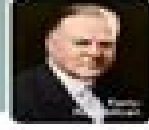
HERBERT HOOVER 1929-1933