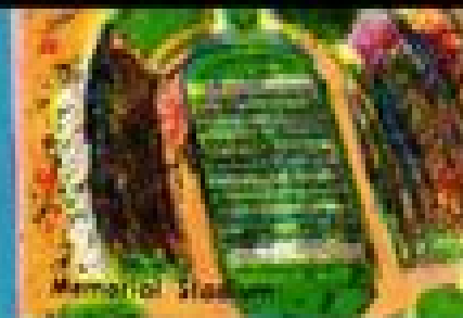
Missouri Botanical Gardens