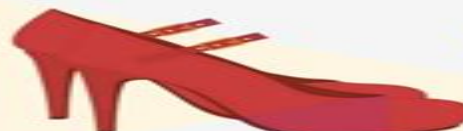
Mary Jane platforms