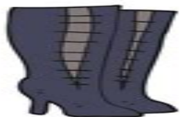
knee high boots