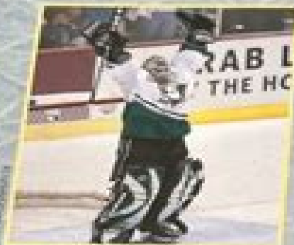
A-Heil: The Conn Smythe Trophy-winning play of J-S Giguere sparked the Mighty Ducks to early-round playoff upsets. Giguere and his teammates finally were eliminated by New Jersey in game seven of the Finals.