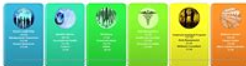
FIGURE 1. EMPLOYERS CONCERNED WITH WORKSITE HEALTH PROMOTION PROGRAMMING

The figure shows the percentage of employers concerned with workplace health promotion programming. The figure shows the percentage of employers concerned with workplace health promotion programming.