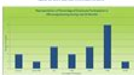
Table 3. EMPLOYEE PARTICIPATION

Table 3 shows the percentage of employees participating in various health promotion programs.