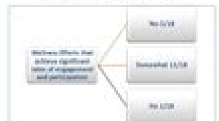
FIGURE 1. EMPLOYEE AND PARTICIPATION

Figure 1 shows the percentage of employees participating in health promotion programming.