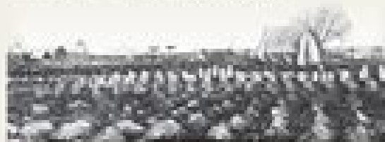
Soldiers' graves near General Hospital, City Point, Va., c. 1861.

On September 11, 1861, the War Department directed commanding officers to keep "accurate and permanent records of deceased soldiers." It also required the U.S. Army Quartermaster General, the office responsible for administering to the needs of troops in life and in death, to mark each grave with a headboard. A few months later, the department mandated interment of the dead in graves marked with numbered headboards, recorded in a register.