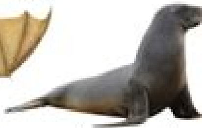
New Zealand Sea Lion